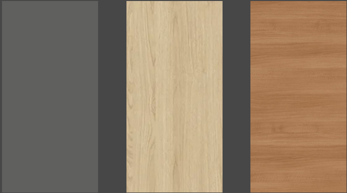
RB-1 PL-1 PL-2