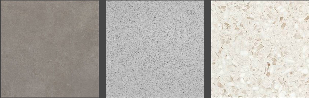
PFT-1 PFT-2 PFT-3